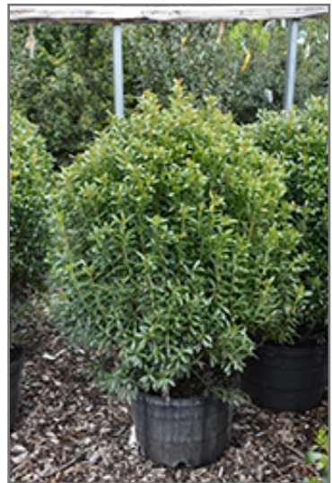
Compact Inkberry Holly

47747 Romeo Plank Road | Macomb, Mi 48044