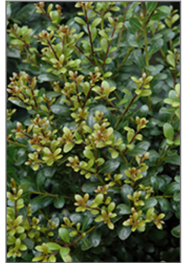
Compact Inkberry Holly foliage