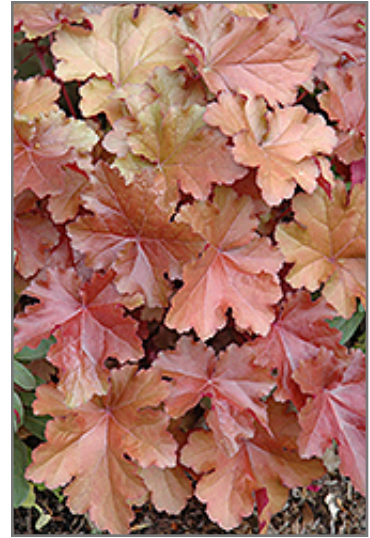
Mahogany Coral Bells foliage

Mahogany Coral Bells is recommended for the following landscape applications;