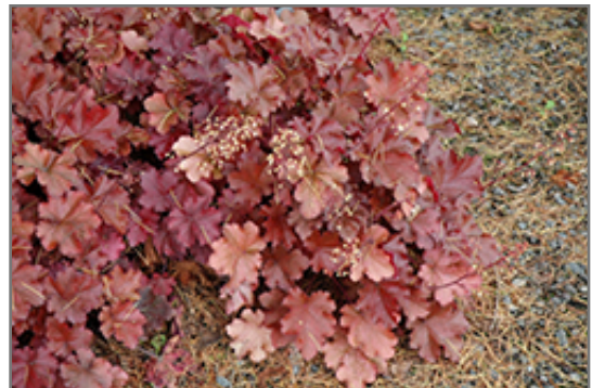
Mahogany Coral Bells

47747 Romeo Plank Road | Macomb, Mi 48044