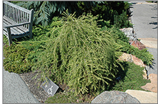
Puli Weeping Larch

This is a relatively low maintenance shrub, and is best pruned in late winter once the threat of extreme cold has passed. Deer don't particularly care for this plant and will usually leave it alone in favor of tastier treats. It has no significant negative characteristics.