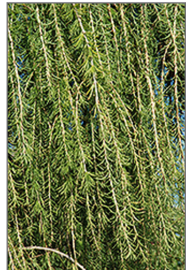
Puli Weeping Larch foliage

47747 Romeo Plank Road | Macomb, Mi 48044