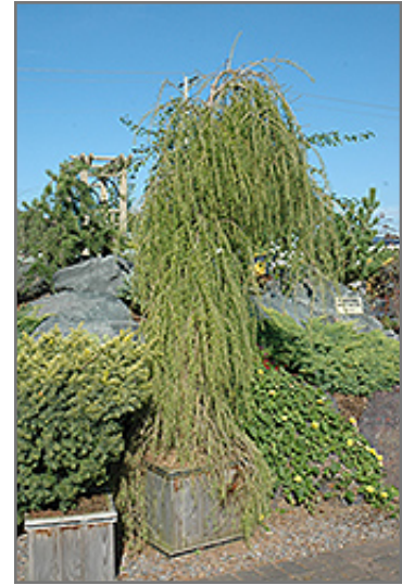
Puli Weeping Larch

This shrub does best in full sun to partial shade. It is quite adaptable, preferring to grow in average to wet conditions, and will even tolerate some standing water. It is not particular as to soil type or pH. It is somewhat tolerant of urban pollution. This is a selected variety of a species not originally from North America.