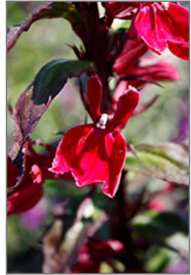
Starship Burgundy Lobelia flowers

Starship Burgundy Lobelia is recommended for the following landscape applications;