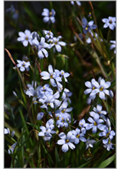
Suwannee Blue-Eyed Grass flowers

47747 Romeo Plank Road | Macomb, Mi 48044