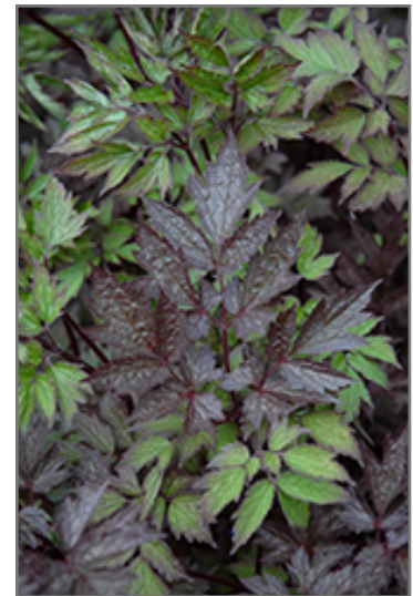
Black Negligee Bugbane foliage

47747 Romeo Plank Road | Macomb, Mi 48044