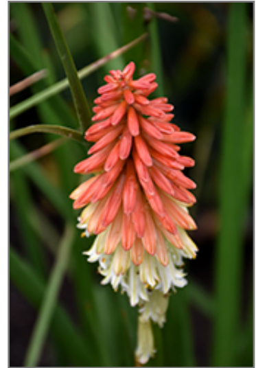
High Roller Torchlily flowers

Stunningly bright, coral orange flowers on perfectly formed spikes create a brilliant border or container planting; makes a great cutflower and attracts hummingbirds