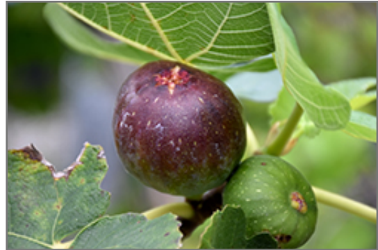
Brown Turkey Fig fruit

This is a multi-stemmed deciduous tree with a more or less rounded form. Its average texture blends into the landscape, but can be balanced by one or two finer or coarser trees or shrubs for an effective composition. This plant will require occasional maintenance and upkeep, and is best pruned in late winter once the threat of extreme cold has passed. It is a good choice for attracting birds to your yard, but is not particularly attractive to deer who tend to leave it alone in favor of tastier treats. It has no significant negative characteristics.