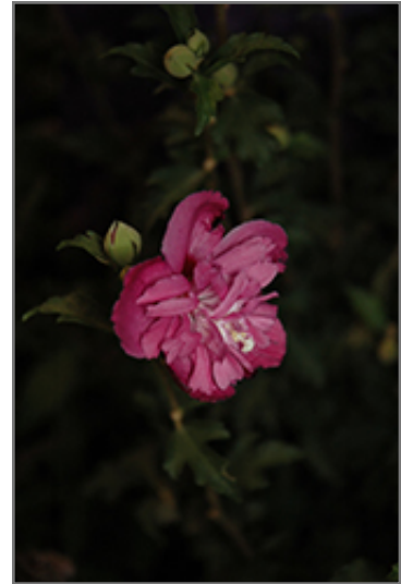
Raspberry Smoothie Rose of Sharon flowers

Raspberry Smoothie Rose of Sharon is recommended for the following landscape applications;