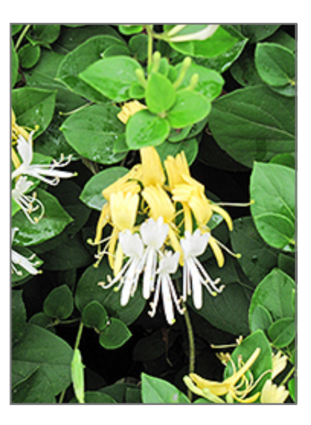
Hall's Japanese Honeysuckle flowers

Hall's Japanese Honeysuckle is recommended for the following landscape applications;