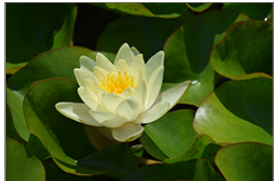
Marliacea Chromatella Hardy Water Lily flowers