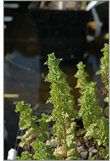
Curly Mint foliage