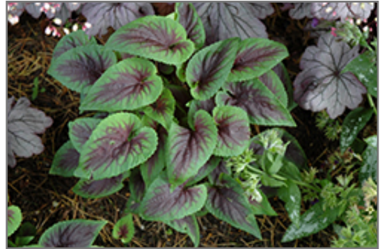
Heartthrob Violet

This exceptional variety has stunning foliage; clumps of pointy heart shaped leaves with contrasting burgundy centers; effective visually in the garden all season long; a terrific edging for the shady border or rock garden