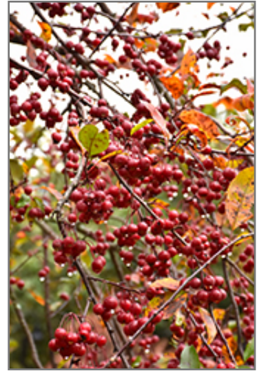
Prairifire Flowering Crab fruit

This tree should only be grown in full sunlight. It prefers to grow in average to moist conditions, and shouldn't be allowed to dry out. It is not particular as to soil type or pH. It is highly tolerant of urban pollution and will even thrive in inner city environments. This particular variety is an interspecific hybrid.