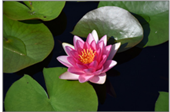
Attraction Hardy Water Lily flowers