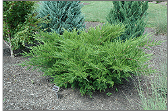
Sea Green Juniper

Sea Green Juniper is recommended for the following landscape applications;