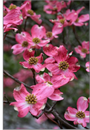
Cherokee Chief Flowering Dogwood flowers

This is a relatively low maintenance tree, and usually looks its best without pruning, although it will tolerate pruning. It is a good choice for attracting birds to your yard. Gardeners should be aware of the following characteristic(s) that may warrant special consideration;