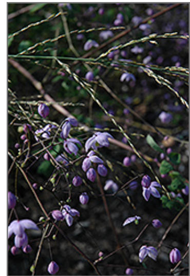
Splendide Meadow Rue flowers