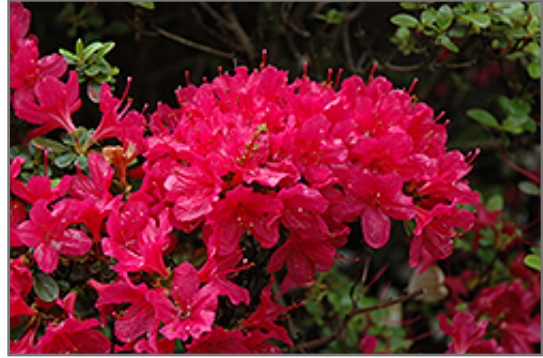
Hino Crimson Azalea flowers

This shrub does best in full sun to partial shade. You may want to keep it away from hot, dry locations that receive direct afternoon sun or which get reflected sunlight, such as against the south side of a white wall. It requires an evenly moist well-drained soil for optimal growth, but will die in standing water. It is very fussy about its soil conditions and must have rich, acidic soils to ensure success, and is subject to chlorosis (yellowing) of the foliage in alkaline soils. It is somewhat tolerant of urban pollution, and will benefit from being planted in a relatively sheltered location. Consider applying a thick mulch around the root zone in winter to protect it in exposed locations or colder microclimates. This particular variety is an interspecific hybrid.