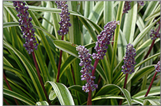
Variegata Lily Turf flowers

Variegata Lily Turf is recommended for the following landscape applications;