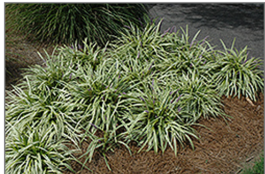
Variegata Lily Turf in bloom