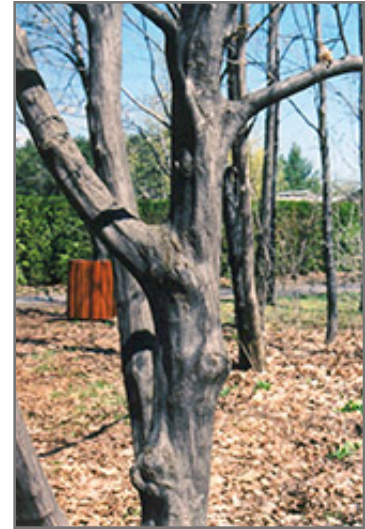
American Hornbeam bark

This tree performs well in both full sun and full shade. It is an amazingly adaptable plant, tolerating both dry conditions and even some standing water. It is not particular as to soil type or pH. It is somewhat tolerant of urban pollution. This species is native to parts of North America.