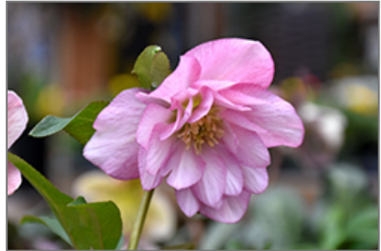
Cotton Candy Hellebore flowers

Cotton Candy Hellebore is recommended for the following landscape applications;