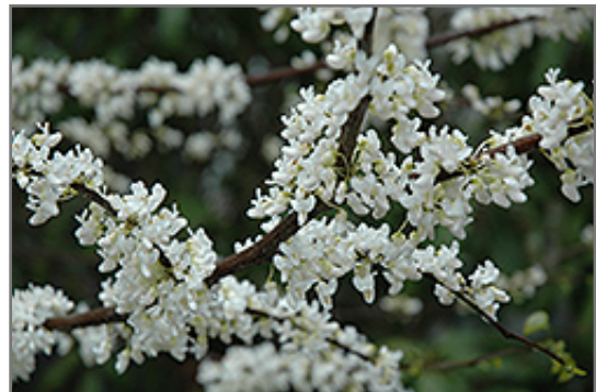
White Redbud flowers

47747 Romeo Plank Road | Macomb, Mi 48044