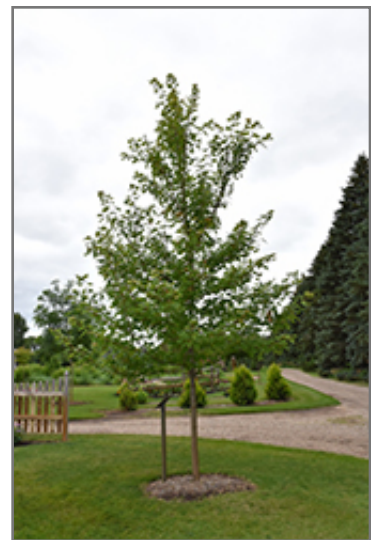
Matador Maple