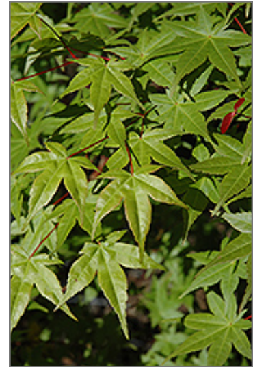
Shindeshojo Japanese Maple foliage

Shindeshojo Japanese Maple is recommended for the following landscape applications;