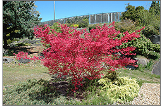
Shindeshojo Japanese Maple in spring

This tree does best in full sun to partial shade. You may want to keep it away from hot, dry locations that receive direct afternoon sun or which get reflected sunlight, such as against the south side of a white wall. It prefers to grow in average to moist conditions, and shouldn't be allowed to dry out. It is not particular as to soil pH, but grows best in rich soils. It is somewhat tolerant of urban pollution, and will benefit from being planted in a relatively sheltered location. Consider applying a thick mulch around the root zone in winter to protect it in exposed locations or colder microclimates. This is a selected variety of a species not originally from North America.