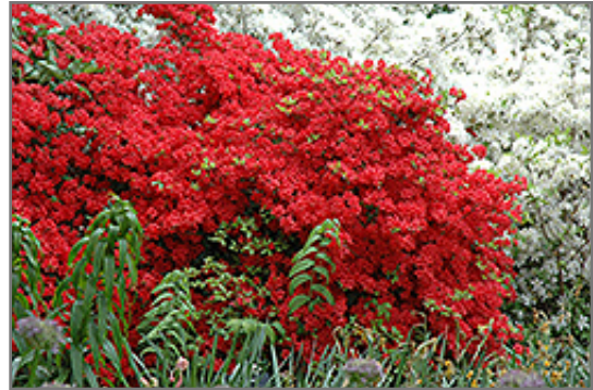
Stewartstonian Azalea in bloom