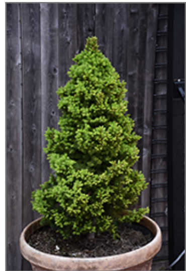
Rainbow's End Spruce

47747 Romeo Plank Road | Macomb, Mi 48044