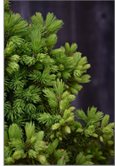
Rainbow's End Spruce foliage

This shrub should only be grown in full sunlight. It prefers to grow in average to moist conditions, and shouldn't be allowed to dry out. It is not particular as to soil type or pH. It is somewhat tolerant of urban pollution, and will benefit from being planted in a relatively sheltered location. This is a selection of a native North American species.