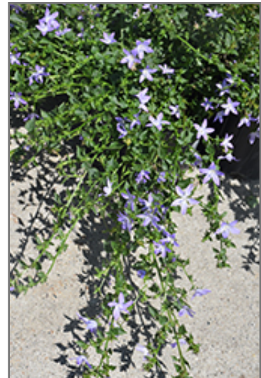
Blue Waterfall Serbian Bellflower in bloom