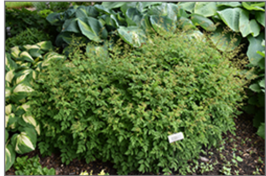
Misty Lace Goatsbeard

Misty Lace Goatsbeard will grow to be about 24 inches tall at maturity, with a spread of 24 inches. Its foliage tends to remain dense right to the ground, not requiring facer plants in front. It grows at a medium rate, and under ideal conditions can be expected to live for approximately 12 years. As an herbaceous perennial, this plant will usually die back to the crown each winter, and will regrow from the base each spring. Be careful not to disturb the crown in late winter when it may not be readily seen!