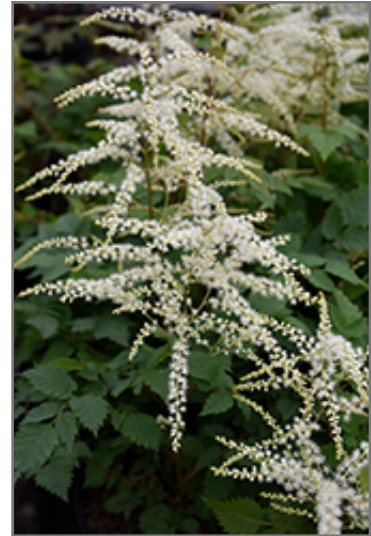
Misty Lace Goatsbeard flowers

Misty Lace Goatsbeard is recommended for the following landscape applications;