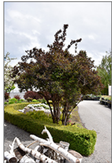
Black Beauty Elder

47747 Romeo Plank Road | Macomb, Mi 48044