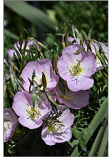
Evening Primrose flowers

Evening Primrose is recommended for the following landscape applications;