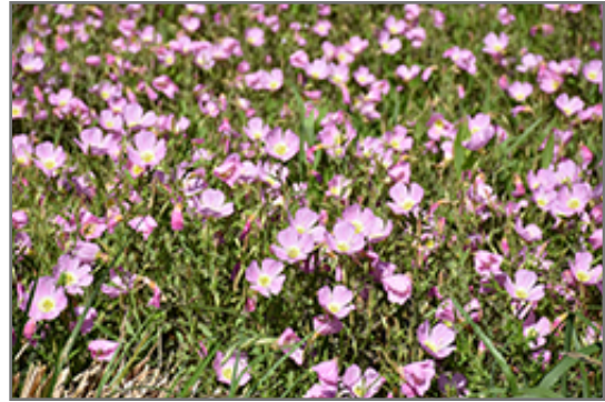
Evening Primrose flowers

Evening Primrose will grow to be about 12 inches tall at maturity, with a spread of 30 inches. When grown in masses or used as a bedding plant, individual plants should be spaced approximately 26 inches apart. Its foliage tends to remain dense right to the ground, not requiring facer plants in front. It grows at a fast rate, and under ideal conditions can be expected to live for approximately 10 years. As an herbaceous perennial, this plant will usually die back to the crown each winter, and will regrow from the base each spring. Be careful not to disturb the crown in late winter when it may not be readily seen!