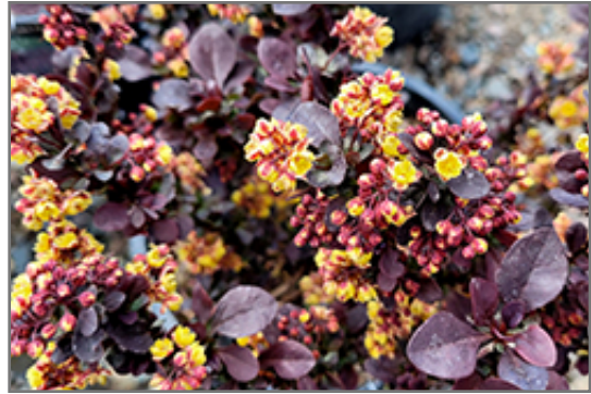
Concorde Japanese Barberry flowers

Concorde Japanese Barberry makes a fine choice for the outdoor landscape, but it is also well-suited for use in outdoor pots and containers. It is often used as a 'filler' in the 'spiller-thriller-filler' container combination, providing a mass of flowers and foliage against which the thriller plants stand out. Note that when grown in a container, it may not perform exactly as indicated on the tag - this is to be expected. Also note that when growing plants in outdoor containers and baskets, they may require more frequent waterings than they would in the yard or garden.