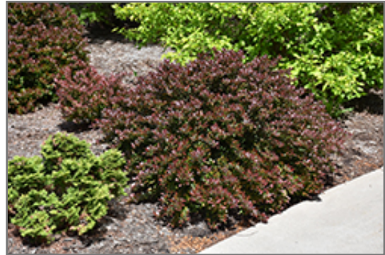
Concorde Japanese Barberry