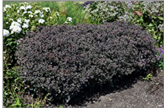
Night Light Stonecrop in bloom

This is a relatively low maintenance plant, and is best cleaned up in early spring before it resumes active growth for the season. It is a good choice for attracting butterflies to your yard, but is not particularly attractive to deer who tend to leave it alone in favor of tastier treats. It has no significant negative characteristics.