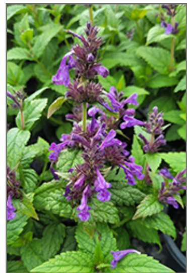
Neptune Catmint flowers