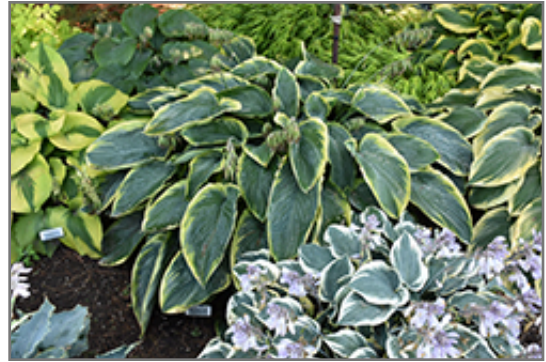
Shadowland Wu-La-La Hosta

Shadowland Wu-La-La Hosta is a dense herbaceous perennial with a mounded form. Its medium texture blends into the garden, but can always be balanced by a couple of finer or coarser plants for an effective composition.