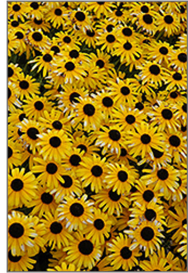
Viette's Little Suzy Coneflower flowers