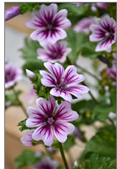
Zebrina Mallow flowers