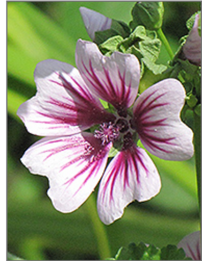
Zebrina Mallow flowers