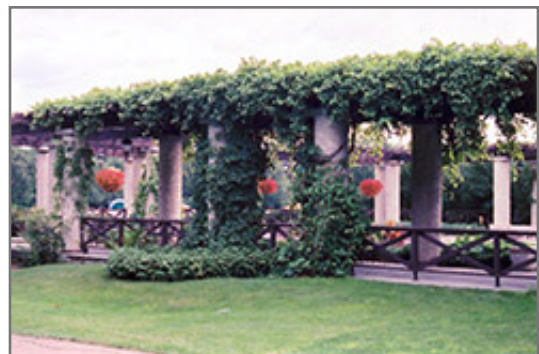
Virginia Creeper