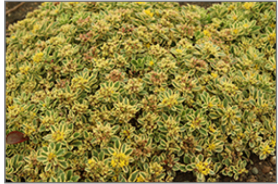
Rock 'N Low Boogie Woogie Stonecrop flowers

Rock 'N Low Boogie Woogie Stonecrop is a dense herbaceous perennial with a mounded form. Its medium texture blends into the garden, but can always be balanced by a couple of finer or coarser plants for an effective composition.