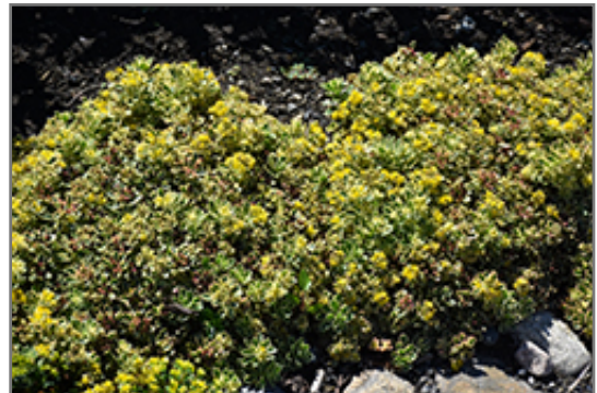
Rock 'N Low Boogie Woogie Stonecrop in bloom

47747 Romeo Plank Road | Macomb, Mi 48044