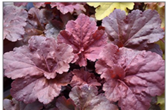
Primo Mahogany Monster Coral Bells foliage

47747 Romeo Plank Road | Macomb, Mi 48044