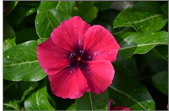
Tattoo Black Cherry Vinca flowers

Tattoo Black Cherry Vinca is a dense herbaceous annual with a mounded form. Its medium texture blends into the garden, but can always be balanced by a couple of finer or coarser plants for an effective composition.