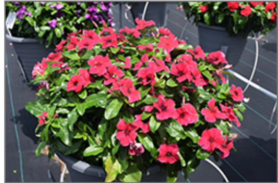
Tattoo Black Cherry Vinca in bloom