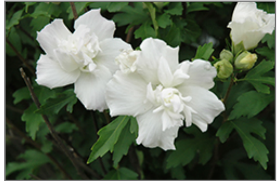
Double White Rose of Sharon flowers

Double White Rose of Sharon is recommended for the following landscape applications;