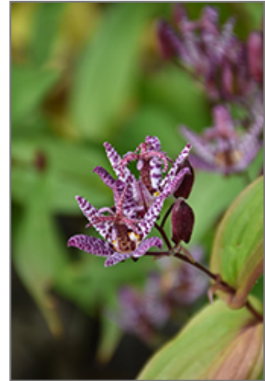
Toad Lily flowers