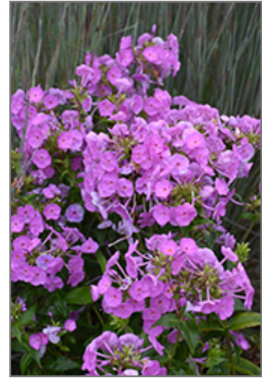
Fashionably Early Flamingo Garden Phlox flowers