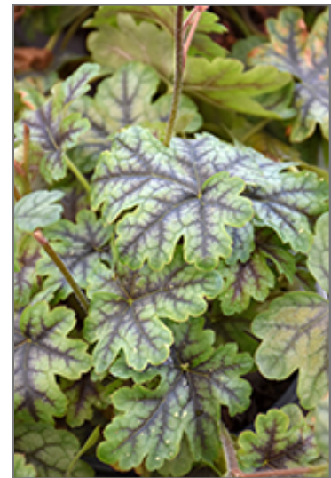
Tapestry Foamy Bells foliage