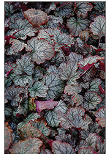
Raspberry Ice Coral Bells foliage