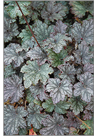
Frosted Violet Coral Bells foliage

This is a relatively low maintenance plant, and should be cut back in late fall in preparation for winter. It is a good choice for attracting hummingbirds to your yard. It has no significant negative characteristics.