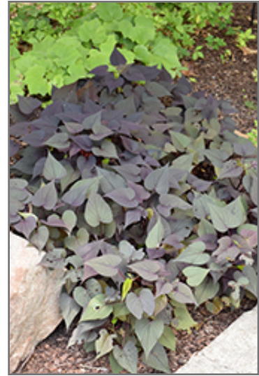
Sweet Georgia Heart Purple Sweet Potato Vine