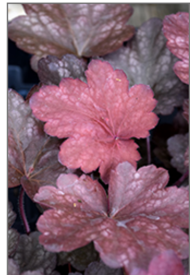
Carnival Candy Apple Coral Bells foliage