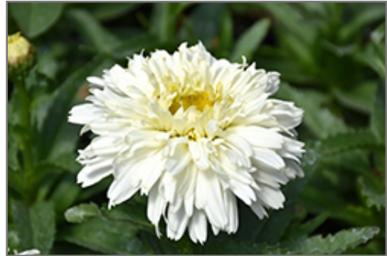
Macaroon Shasta Daisy flowers